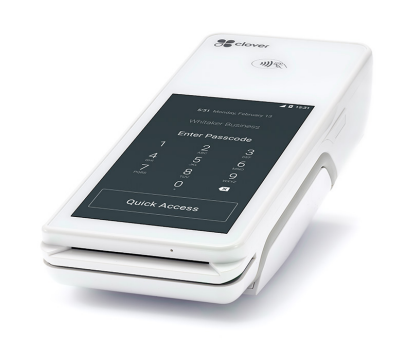
Clover Flex Robust functionality. Ultimate flexibility. Total simplicity.

The flexible solution designed to meet your full range of payment and point-of-sale needs.